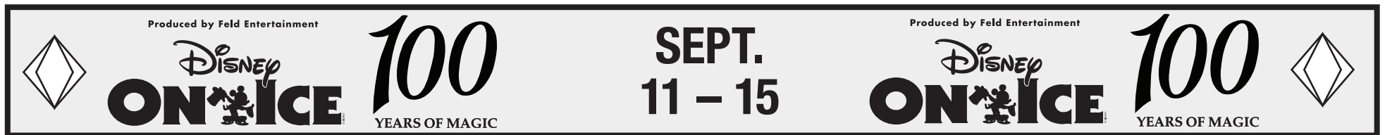
RIGHT EXTENSION FOR EARS